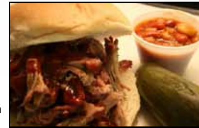
Pulled Pork Sandwich with baked beans