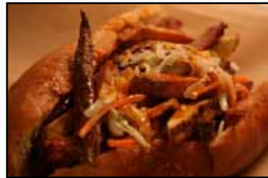
The Rub Poor Boy