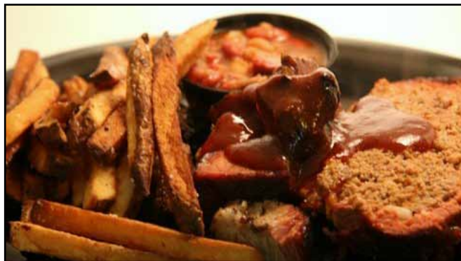
Meatloaf with homemade fries and baked beans